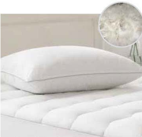
100% Cotton Shell, 233 Thread Count

Silky and luxurious with a premium down-like loft and feel. Trillium® fiber provides a true down like performance and offers adjustable support.