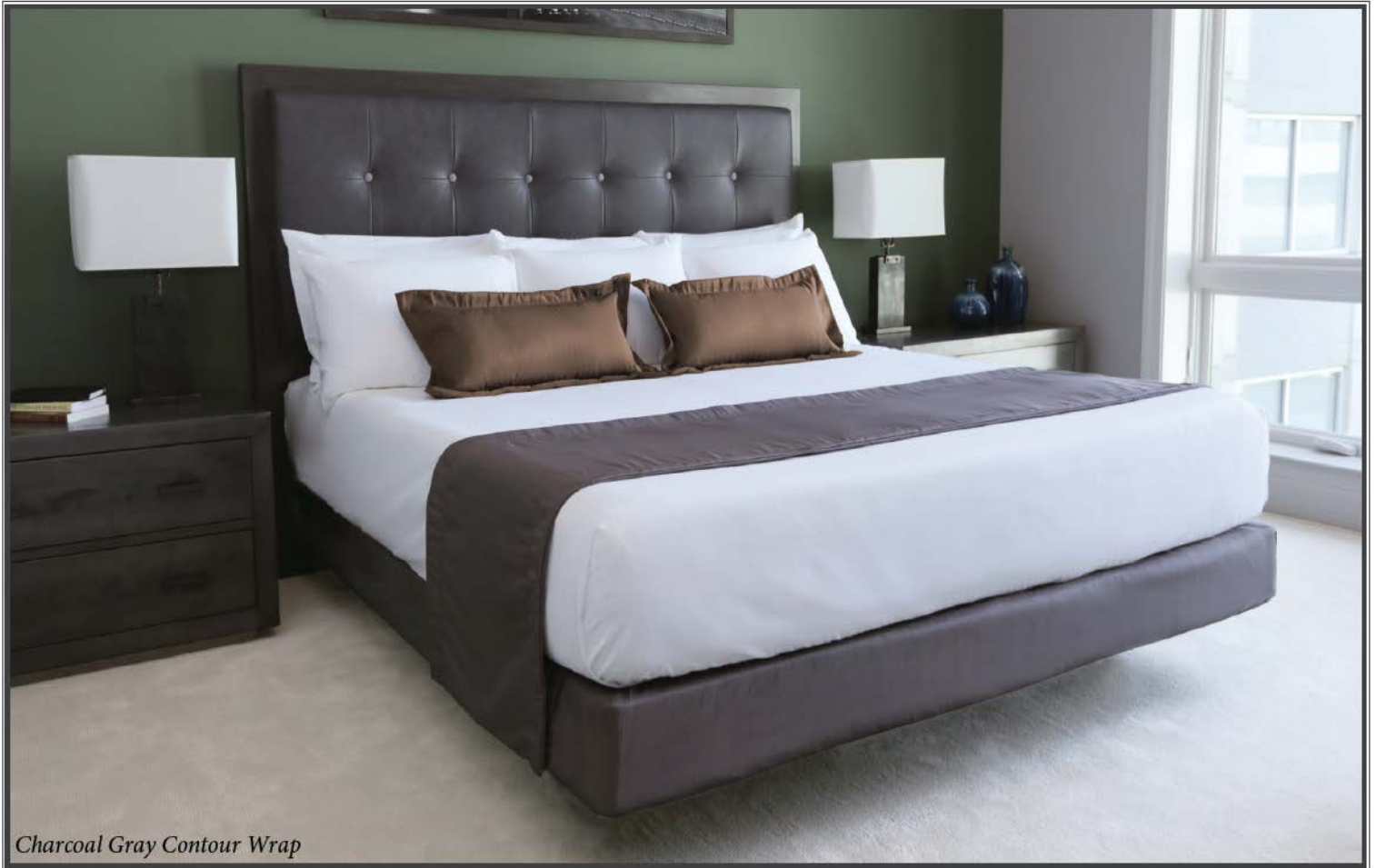
Charcoal Gray Contour Wrap

AVANT-GARDE SOLUTION TO BOX SPRING PROTECTION