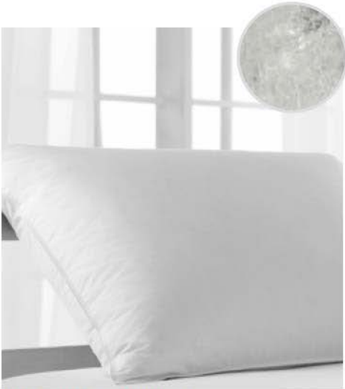
100% Cotton Shell, 233 Thread Count

Give your guests high-loft comfort with Lux-Loft® fiber, a highly resilient true down alternative with adjustable polyester clusters that provide maximum comfort and support. This pillow features an antimicrobial dust barrier cover.